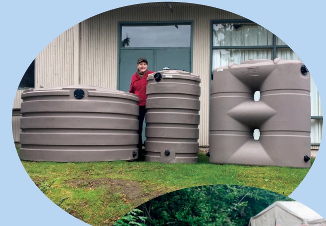
Cisterns are available in a variety of shapes, sizes and colors to fit your property.

RainWise rebates for cisterns vary based on the square feet of roof area captured and the size of the cistern (the range is between $1.75 and $3.43 per square foot). Cistern rebates typically cover between 50 and 100 percent of the total cost of the project. A minimum of 400 square feet of roof area must be captured to qualify for a rebate. Installations can include one cistern, multiple cisterns connected together in one location, or multiple cisterns in various locations.