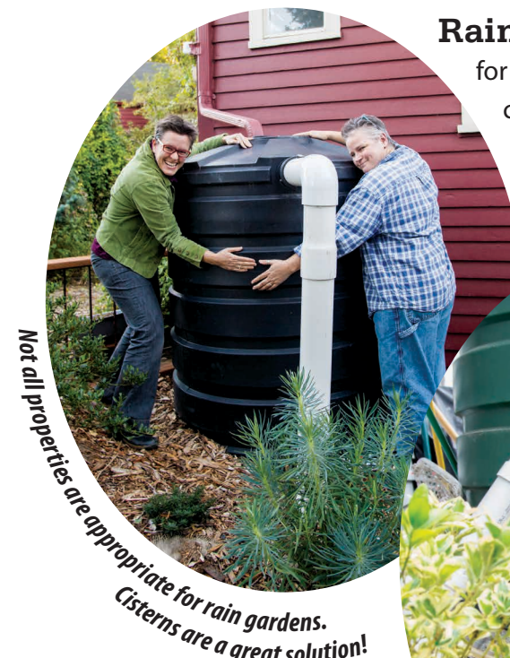
Not all properties are appropriate for rain gardens. Cisterns are a great solution!

Rain gardens require specific property conditions to work. When a property is too steep, too small, or has insufficient drainage for a rain garden, cisterns can be a great solution.