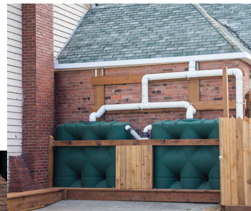
A number of large buildings have done RainWise installations. The Alnoor Mosque congregation (above) chose the slimline option to fit a narrow space. At the United Methodist Church (left) three large cisterns capture ALL the water that falls on its roof and provides summer water for its gardens.