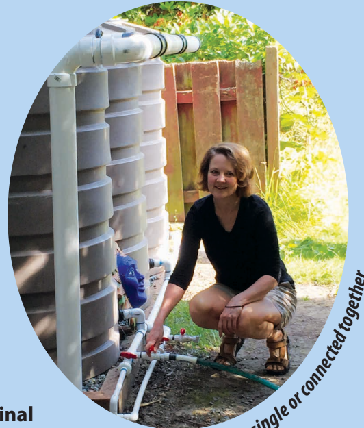
Cisterns can be single or connected together